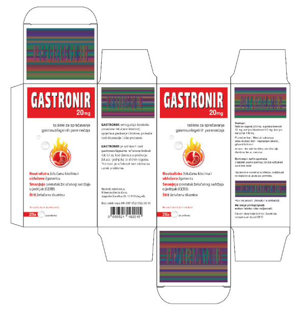
Figure 1. Packaging of the drug GASTRONIR

A typical drug in the daily collection is GAS-TRONIR. The name is recognized in two spectra (image 1 and 2). The same goes for the instructions for use and the description of the content of the drug. Dual information contains the name of the pharmaceutical house