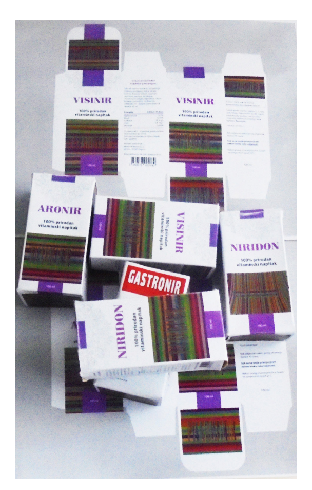
Figure 4. Packaging for the collection of drugs PHARMANIR

The packaging for drugs for the pharmaceutical company PHARMANIR was designed for the Conference "Blaž Baromić" in Senj 2018, with protective IRD line structure. The four drugs ARONIR, NIRIDON, VISINIR and GASTRONIR have in common the emphasis on the display of text (image 4). Visually, there is no appropriate information about the conference or about where it takes place. The industry Pharmanir's visual idenity is the same as that of other collections of drugs.