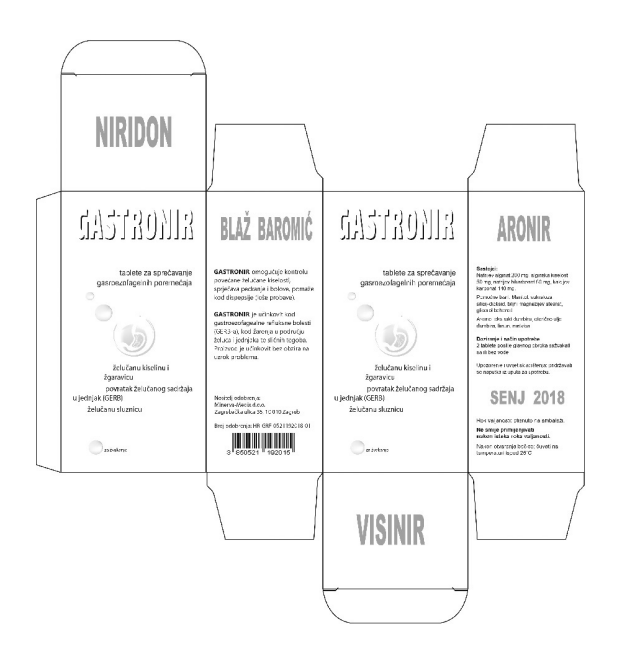
Figure 2. Packaging GASTRONIR, near infrared spectrum at 1000 nm

PHARMANIR. The text is recognized in the visual spectrum and is designed as line graphics. Each color of the individual line has its twin in the NIR spectrum. These twins of color have offered the information "NIRIDON" and the suitable name for the conference, "Blaž Baromić". Carbon black color has been added to the information reader with EAN codes in order for it to be recognized by cameras for the visual and NIR spectrum.